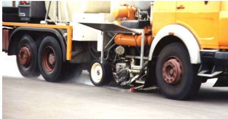
Measuring Tire Properties by Means of the Universal Skid Resistance Measurement Device (URM II)

By means of the Universal Skid Resistance Measurement Device (URM II) tire properties can be investigated both systematically and objectively. Dependencies between tire load, slip, sideslip angle, camber angle and the forces and torques interacting between road and tire are measured. The analyzed measurement results can be directly transferred into tire maps.