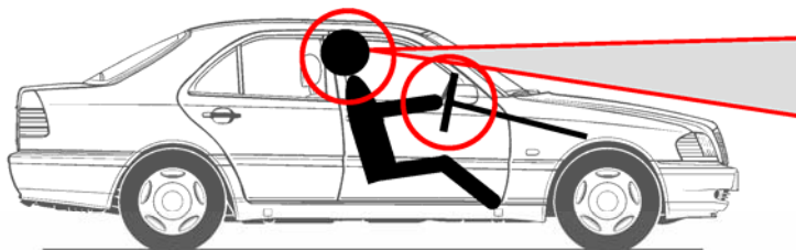
Driver's perception of vehicle movement